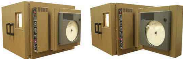
MODEL 21-350ER shown with optional window and chamber light & 10" "swing-out" circular chart recorder