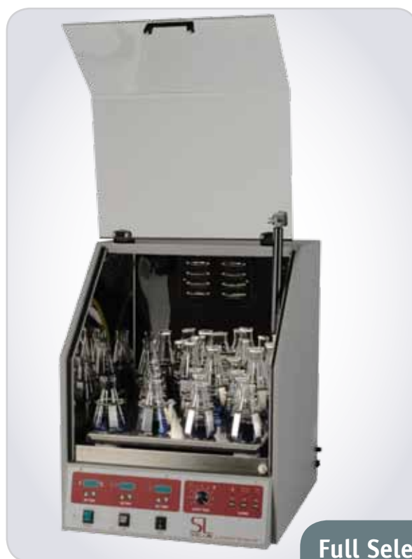
Bench Top SI4

All models use four load bearing delron supports at each corner to reduce the stress on the drive shaft.