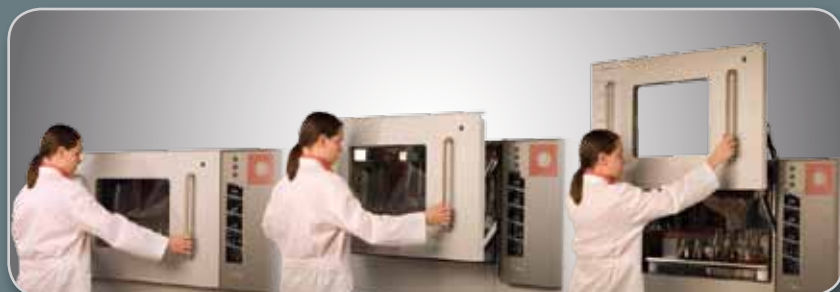
SI9 Door is Equipped with Hydraulic Pistons for Easy Lifting