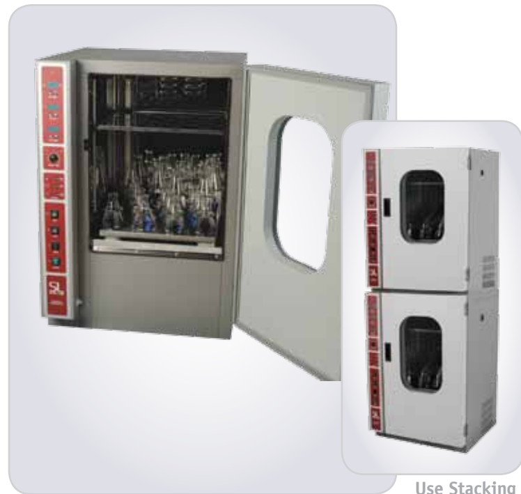
SI6 | SI6R | SI6R-HS