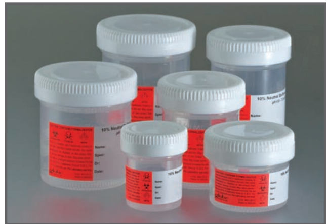
Items #6518FL, 6520FL, 6522FL, 6524FL, 6525FL, 6527FL